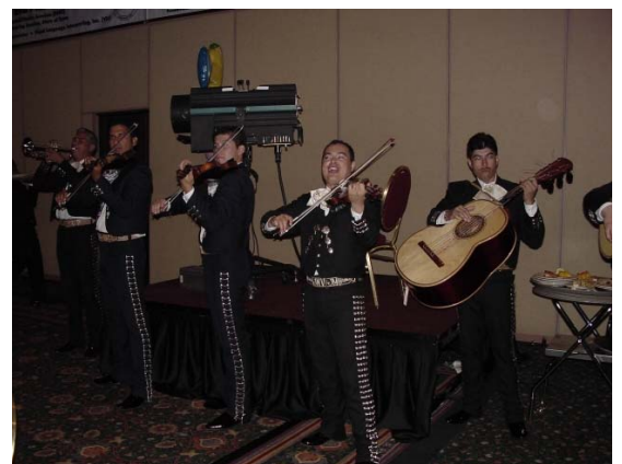
The Mariachi Band>>