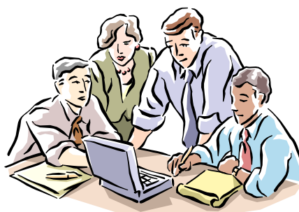
GPRID held a total of seven business meetings in the past year.