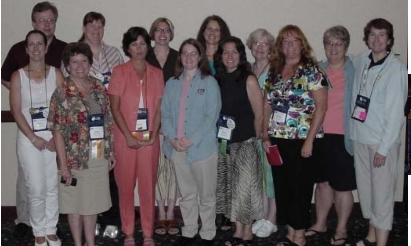
Region I group photo.