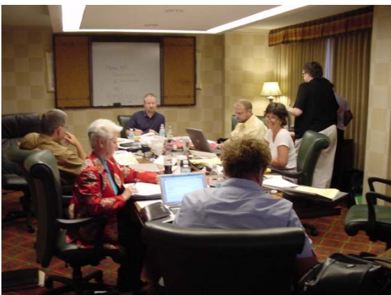
<<RID Board Meeting. (It wasn't all play.)